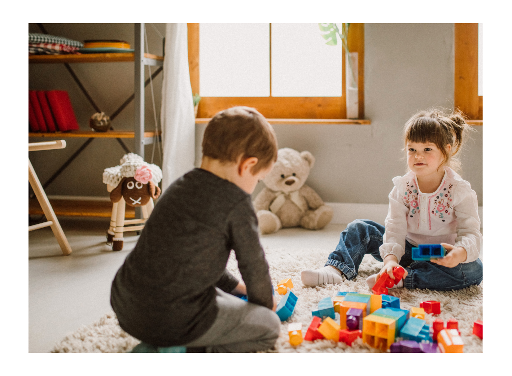
Sometimes I play by myself. Sometimes I play with my brother, Devonte.