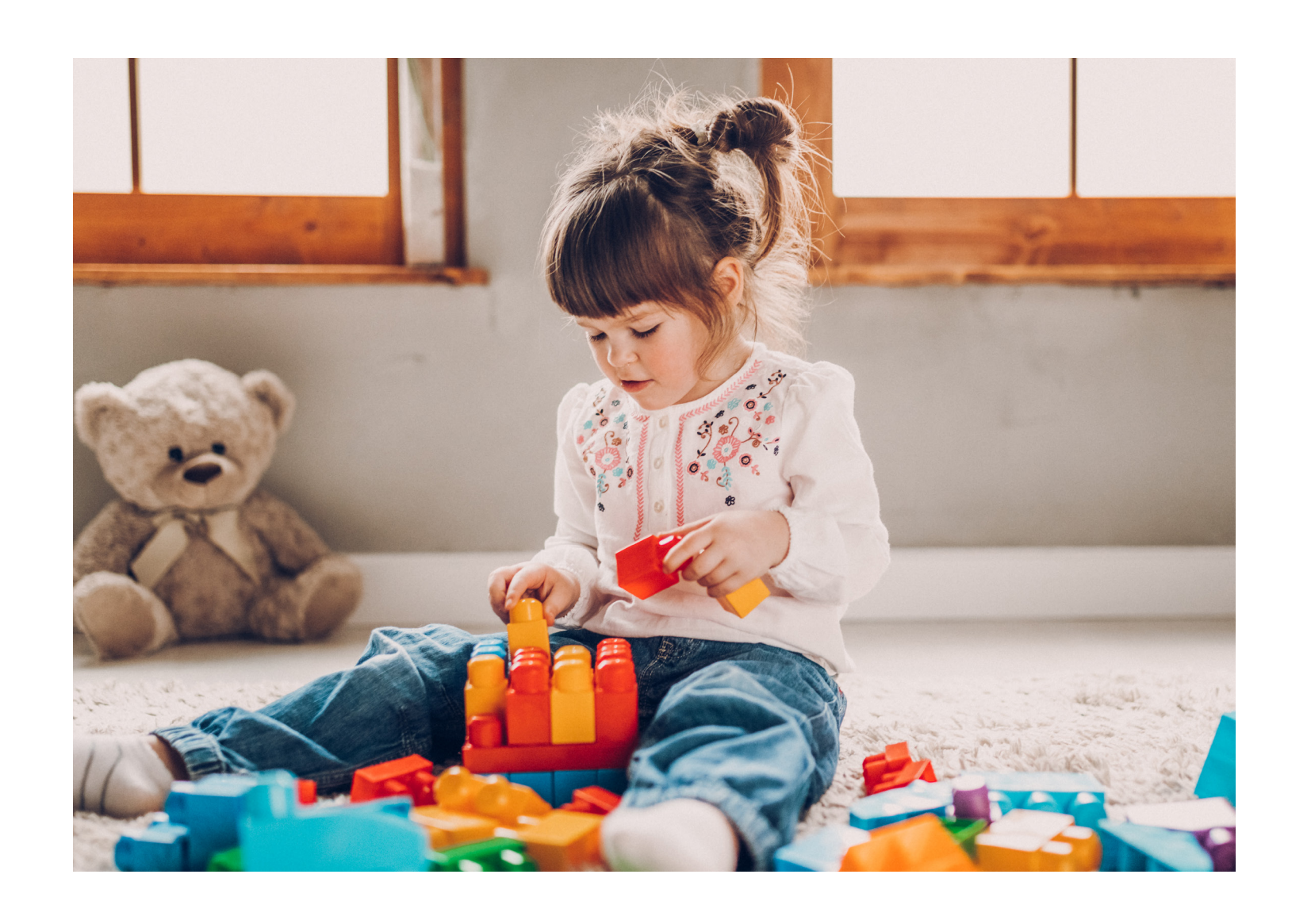
I like to play.