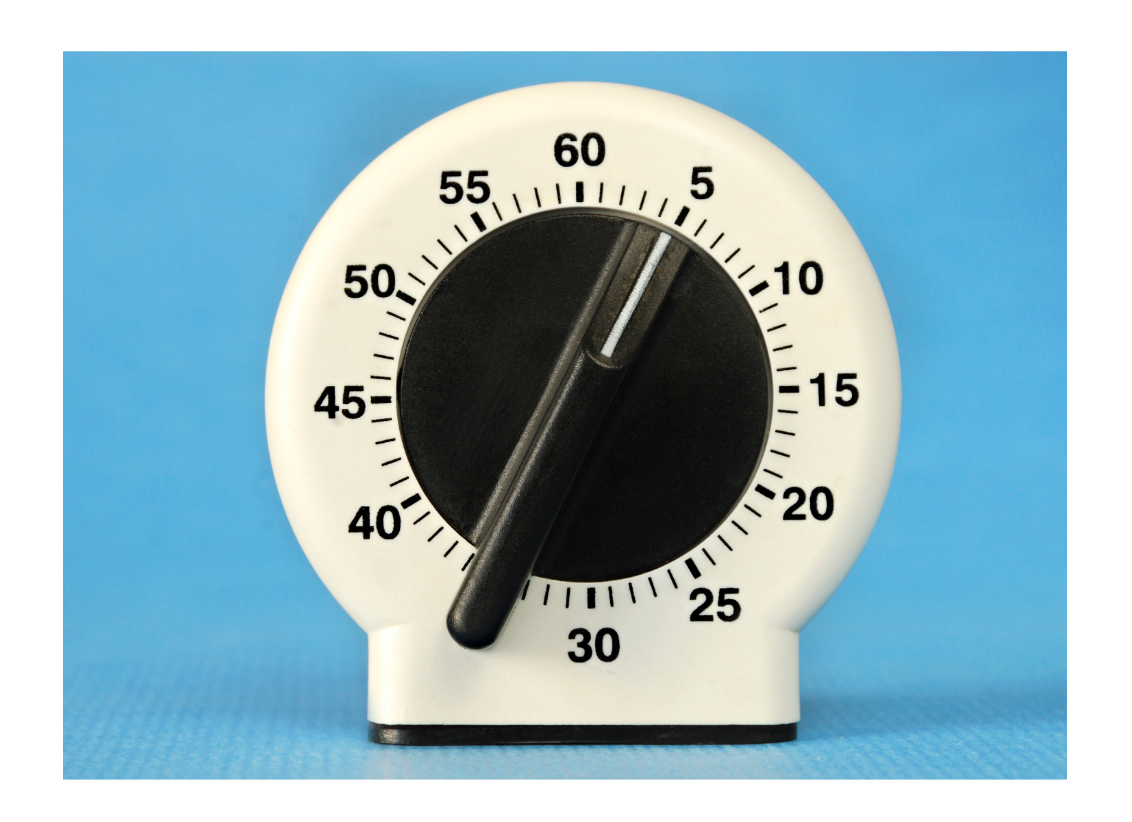
When it is time to clean up, my Mom or Dad sets a timer for me and tells me, "Five more minutes of play."